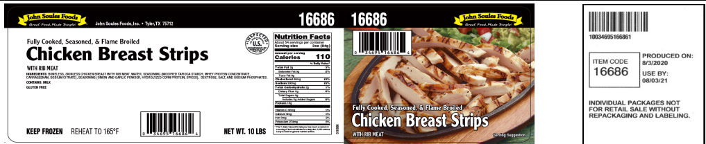
(the image below is an enlarged version of one of the left panel)