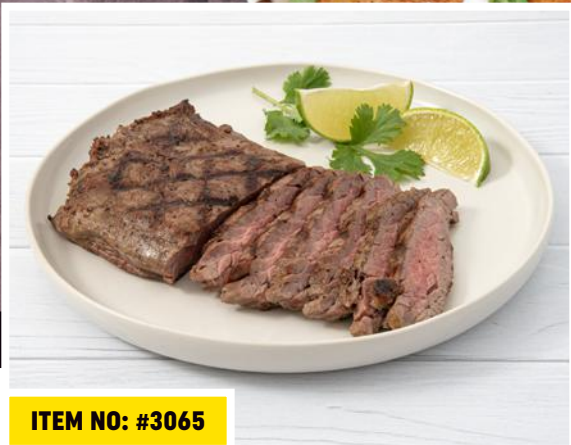
ITEM NO: #3065

For Menu Inspirations, Visit: www.JSF4U.com/FSMI