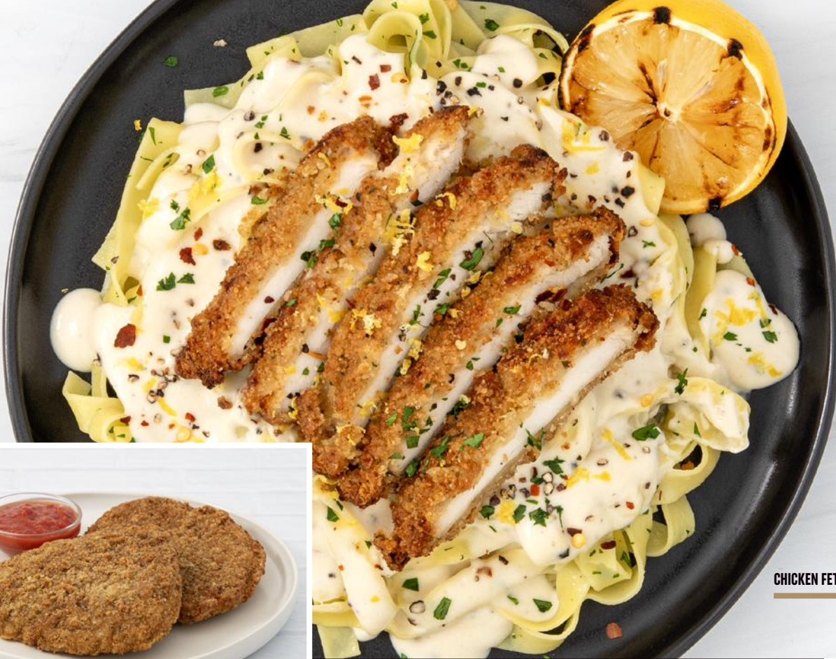
CHICKEN FETTUCCINE LIMONE