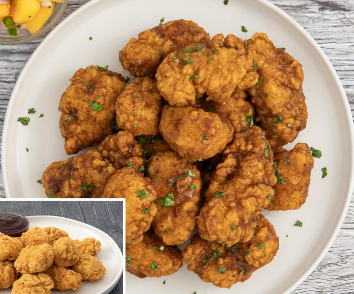
PEACH JERK WINGS